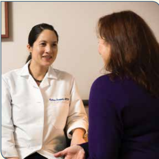
Virginia Mason Health System is centered on the patient rather than the provider.