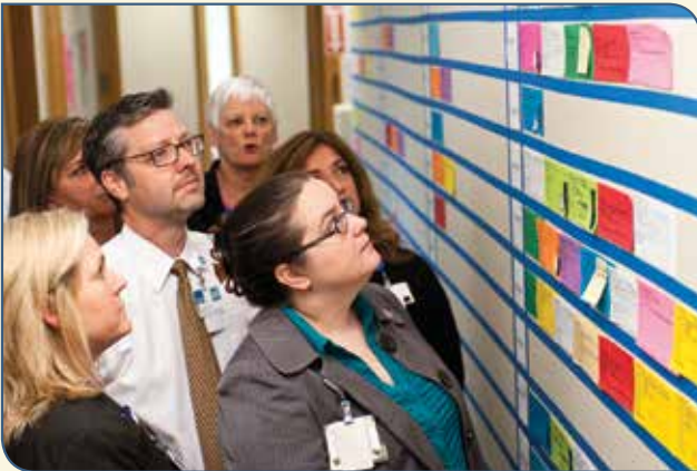
Each team member uses tools and techniques that allow a shared language and approach.