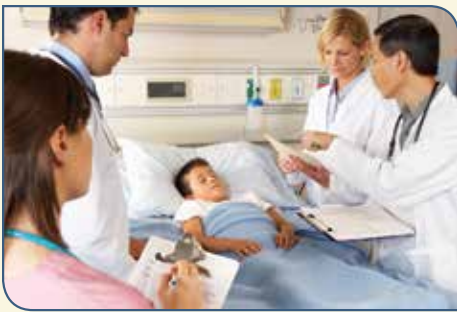
Interprofessional rounds can include up to 10 professionals and the infant's parents.

Women and Infants Hospital operates one of the nation's largest single-family-room Neonatal Intensive Care Units (NICU), where we had the opportunity to observe interprofessional rounds during our visit. The rounds included a team of nearly 10 people, including an attending physician, a nutritionist, a pharmacist, a nurse practitioner, a resident, a respiratory therapist, and the infant's parents. The nurse practitioner presented the case, speaking on behalf of the team who had cared for the infant—one of two twins who were both in the unit—overnight. The NICU uses geographic rounding , meaning that the team goes to the room where the nurse is caring for the infant. This allows the nurses to fully participate in rounds without leaving their patients.