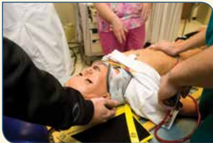
The simulation debrief enables participants to make connections between their skills and those of their teammates.

The debrief enables all individuals to better understand and adapt their behavior, but more importantly, to make connections between their individual skills, expertise, and actions and those of their teammates. The experience can prove invaluable, by breaking through traditional authority boundaries and expanding the concept of the team.