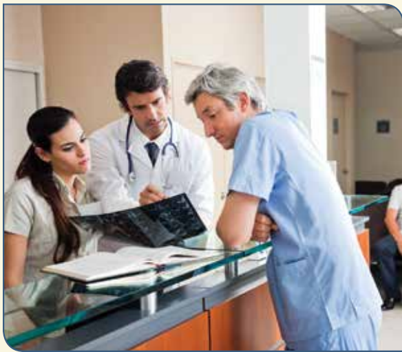
The UBCL uses unit-based data to improve patient outcomes.

The Unit-Based Clinical Leadership (UBCL) structure at UPHS grew out of the Blueprint for Quality and Patient Safety. The structure works to promote an interprofessional approach to achieving patient safety and quality in patient care throughout the system, with the main goals being to improve coordination of care and reduce variations in practice to lead to better patient outcomes. The teams include a nurse leader, a clinical nurse specialist, a physician (who practices on the unit), and a quality and safety project manager (who has access to a “data-mart,” created for the UBCL teams to use data at the unit level). Many teams also include a pharmacist, and UBCL meetings can include dozens of people who can participate, as needed, as members of the care team on each unit.